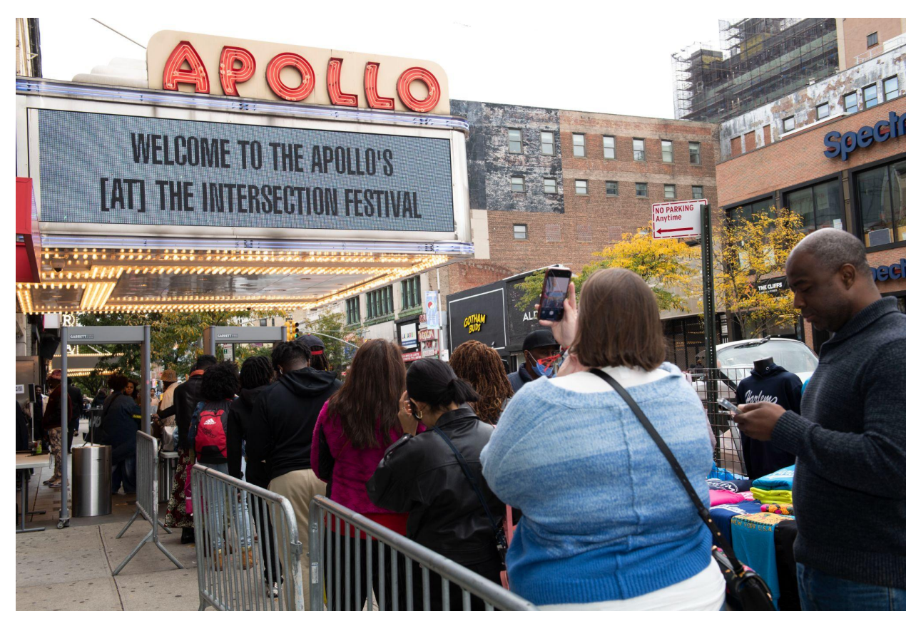
(Apollo Marque. Photo credit: Elena Olvio/The Apollo)

Over the weekend Oct. 6-8, 2023, celebrities, artists, cultural movers, and festival goers met [at] The Intersection, The Apollo's inaugural festival of arts & ideas curated by Ta-Nehisi Coates . The festival was a culmination of Coates' times as The Apollo's first artist-in-residence.